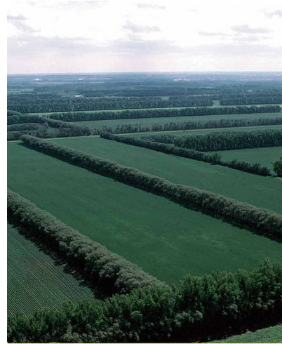
Hedges & windbreaks