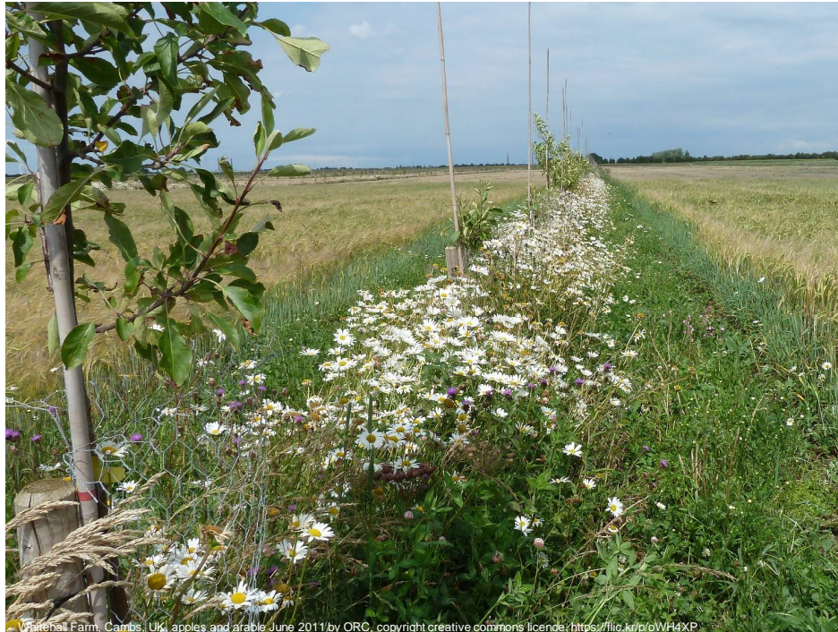
Witcham Farm, Cambs, UK, apples and arable June 2011