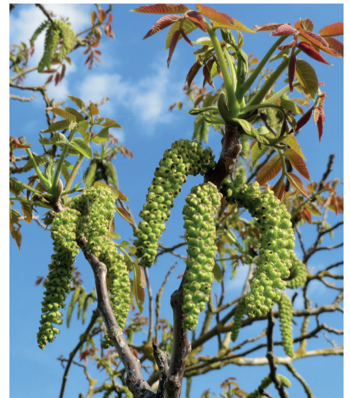
.. Male catkins develop in the spring with new leaves.

increase the insulin level in diabetic patients 21 . The wood of the walnut is highly prized, being strong, attractive and easy to work. Good quality logs are sold for veneer and can command high prices 7 . It is also used in agroforestry 7, 12, 22 .