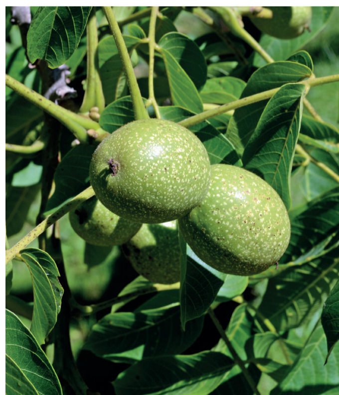
.. Fruits ripening on the tree.

Because of its long history of cultivation, the natural distribution range of this species is not clear 7, 8 . It is thought to be native to the Mediterranean (Southern Europe, Western Asia) and Central Asia 9 ; in the latter area the mountains of the West Himalayan chain in the Kashmir, Tajikistan and Kyrgyzstan are considered to be its centre of origin 2 . Fossil evidence, however, shows that in some putative areas of origin in Central Asia such as Kyrgyzstan, the species was introduced for agricultural purposes only 1000–2000 years ago 10 . Pollen records and nutshell finds show earliest cultivation in the Mediterranean area; e.g. in Italy around 6000 years ago and in Anatolia, north-eastern Greece and Croatia around 4000 years ago 11 . It has been widely cultivated