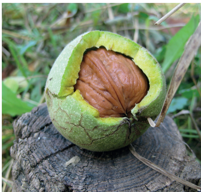
.. The ripe walnut, emerging from the fruit.

Walnut is very appreciated for its nuts, which are a highly nutritious food source. They are rich in oil composed of unsaturated fatty acids, proteins, vitamins and minerals. The kernels contain a wide variety of flavonoids, phenolic acids and related polyphenols, which have good antioxidant, anti-atherogenic, anti-inflammatory and anti-mutagenic properties 16 . A diet rich in walnuts is also thought to have a cardiovascular protective effect 17, 18 . Bark or leaf extracts are used worldwide in traditional medicine to treat a variety of conditions 19 including fungal infections such as Candida , to inhibit the growth of bacteria responsible for dental plaques and oral hygiene problems 20 , or to