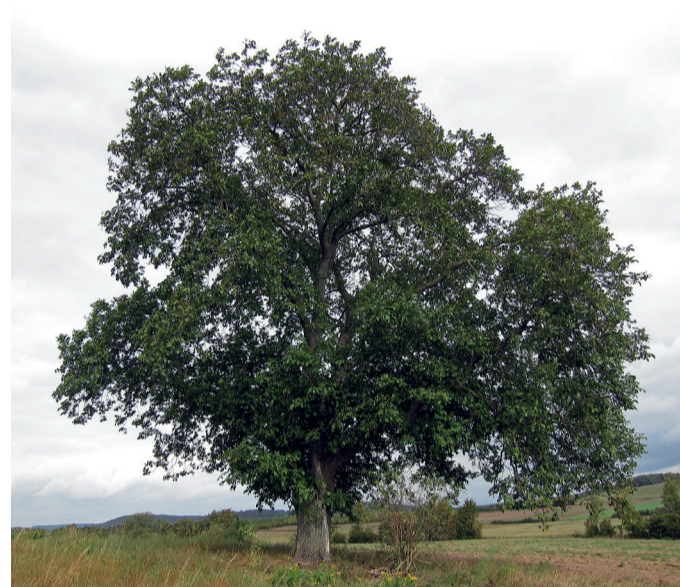
.. Mature walnut tree with large spreading crown (Bavaria, Germany).

The common walnut ( Juglans regia L.) is a large, deciduous tree, reaching a height up to 25–35 m and exceptionally a maximum trunk diameter up to 2 m 1 . It is long-lived: normally 100–200 years, but some specimens may reach 1000 years old 2 . It has a deep root system, with a substantial tap root starting from the juvenile stage 1, 3 . The bark is silver-grey and smooth between deep, wide fissures 4 . The leaves are 20–45 cm long, with 5 to 9 leaflets, the ones from the apex being larger compared with those from the base of the leaf 4 . Crushed leaves have a scent like shoe-polish 4 . The crown diameter of the common walnut is larger in relation to its stem diameter than any other broadleaf tree species used in Europe 5 . The fruit ripens during hot summers and is a large rounded nut of 4–5 cm and weighing up to 18 g 6 . It may be propagated both by seeds and also vegetatively. It can hybridise and it has been found that the hybrids between common walnut and black walnut ( Juglans nigra ) have good vigour and form 5 .