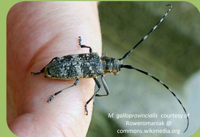
M. galloprovincialis

pine wood nematode Bursaphelenchus xylophilus