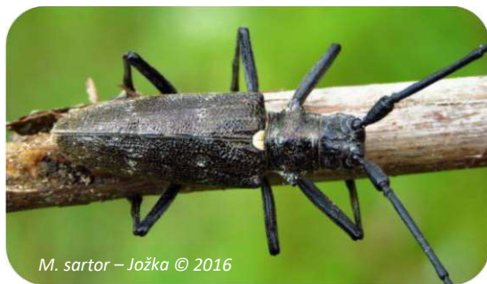
M. sartor