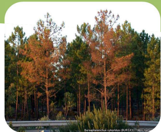
Bursaphelenchus xylophilus (BURSXY) https://gd.eppo.int